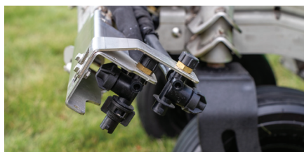
Dual Nozzle Boom