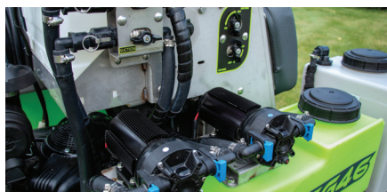
Dual Diaphragm Pumps