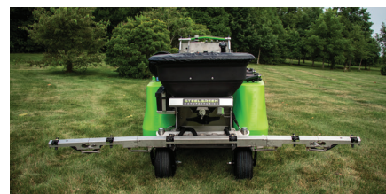
12' Adjustable Boom