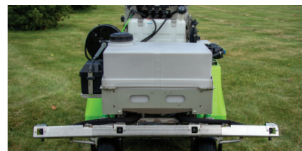
35-Gallon Complete Drain Rectangle Tank