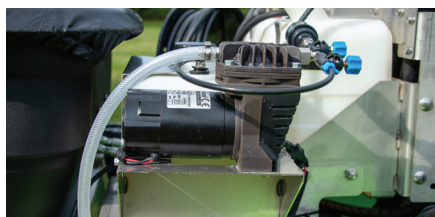
2.5-Gallon Foam Marker