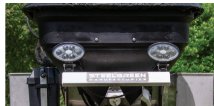
LED Light Kit