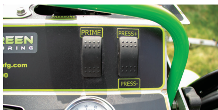
Pressure Control System