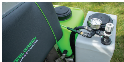
7-Gallon Independent Chemical Tank