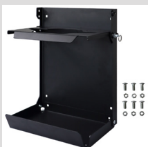
Sprayer Mounting Rack FZAANS