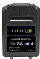
18V/5.2Ah Battery Pack FZAAEM