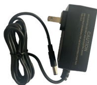
21V/1A Battery Charger FZAAEP