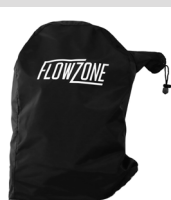
4-G/2.5-G Sprayer Covers FZAAML/FZAAMK