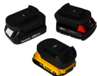
Milwaukee® & Dewalt® / Makita® Battery Adapter Kits FZAAPC/FZAAPB