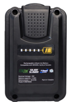
18V/2.6Ah Battery Pack FZAAEN