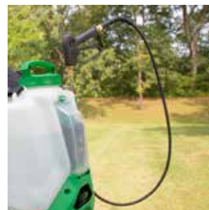
UV-Resistant PVC Hose