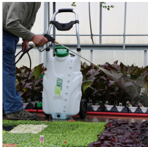
Eliminate manual pumping

Experience streamlined performance and an easier way to spray with FlowZone®. These durable sprayers are built to withstand the demand of daily use and a variety of chemicals.