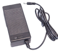
21V/2.5A Battery Charger FZAAEL