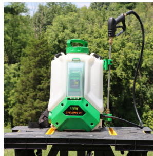
Top quality components