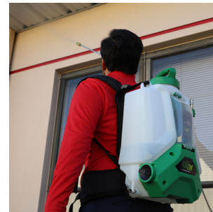
Spray over 25-feet